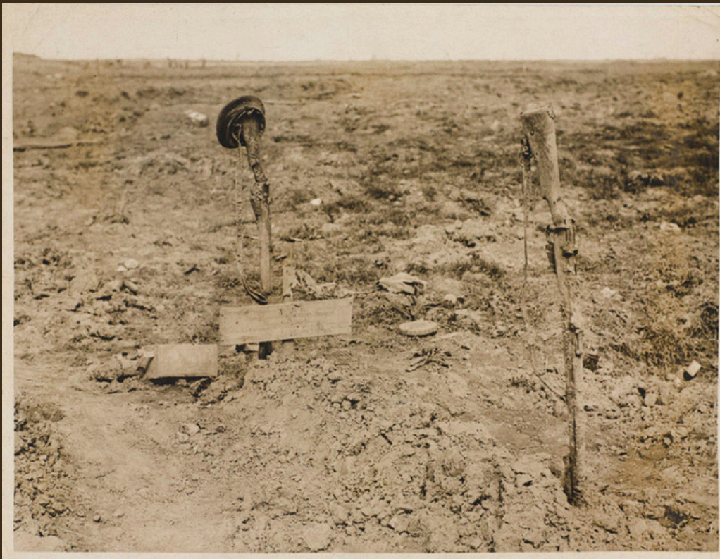
Grave of an unknown British soldier near Ginchy, 1916

Maison Française d'Oxford, 22-23 January 2026